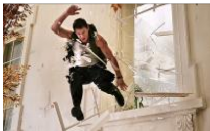
Image from White House Down

Death is Hollywood’s greatest villain, giving the measure to its heroes and appearing in a dozen guises every time we go to the cinemas. He could be President Snow trying to kill Katniss Everdeen in The Hunger Games, the virus that sweeps the planet in World War Z, or even the classic cowled figure who stalks teenagers in Final Destination. Whatever Death figure the hero confronts, it will represent the end of a way of life, happiness, and hope. Death is the ultimate villain because Death is the ultimate full stop.